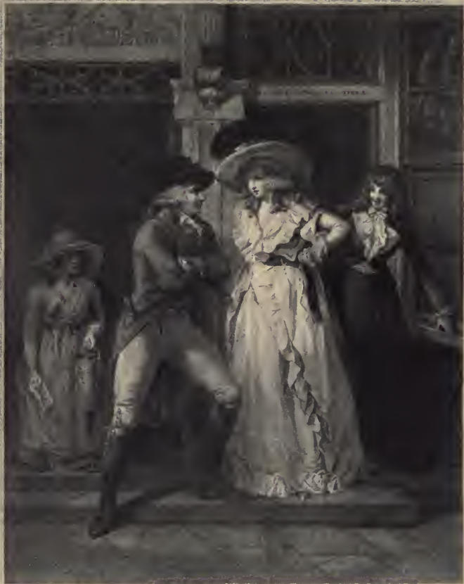
Plate 3. th